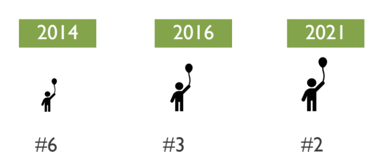
Exhibit 3. Early Childhood Development Ranked as a Top Priority Issue in 2014, 2016, & 2021

Looking at the past three studies (Exhibit 3), ECD has increased in its importance since 2014 when it was the sixth most cited issue.